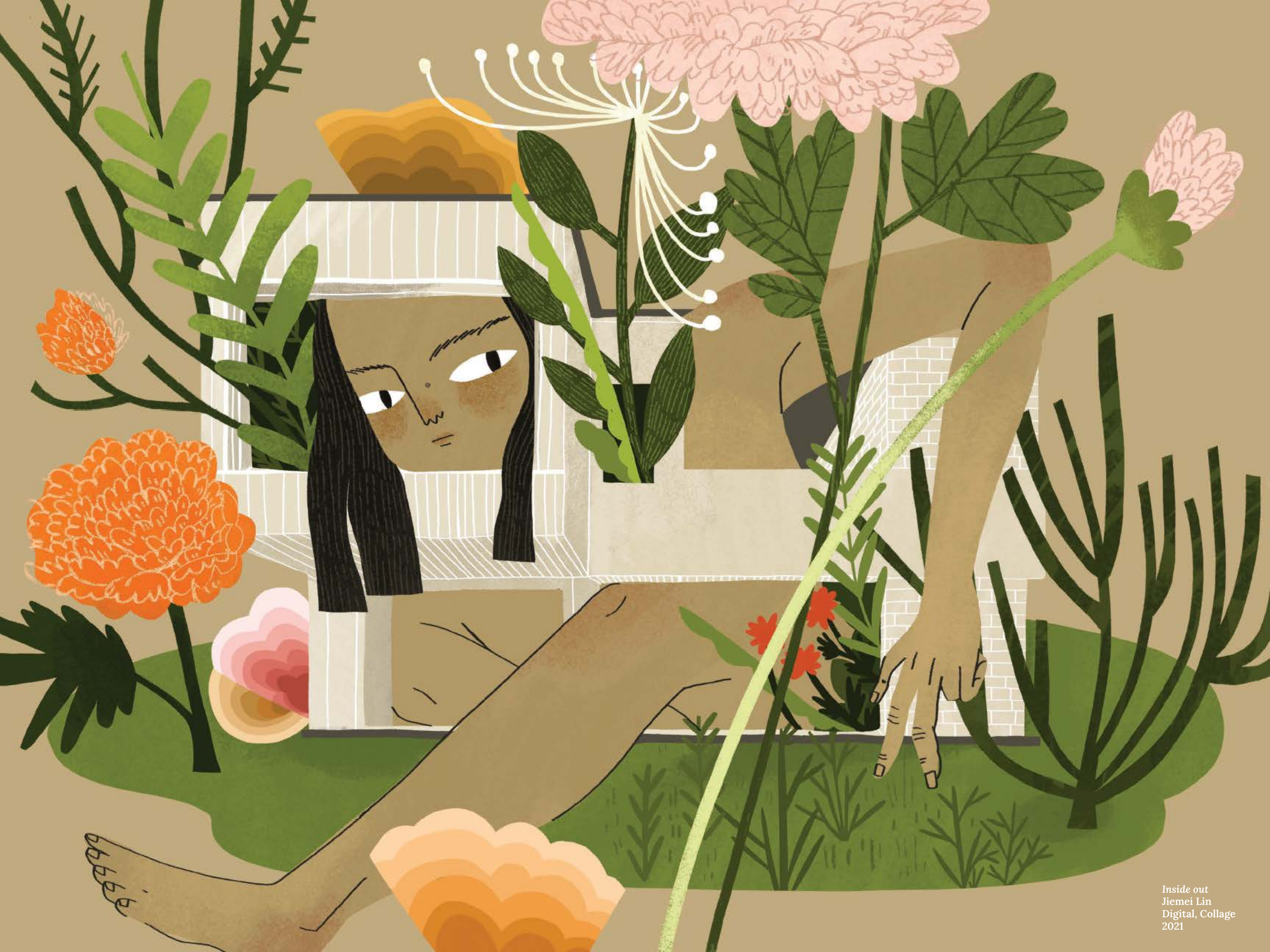
Inside out Jiemei Lin Digital, Collage 2021